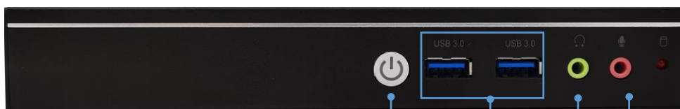
Power Button 2*USB3.0 Line out Mic in