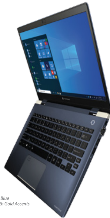
Onyx Blue with Gold Accents

At just 870 g , the Portégé X30L-G changes the game for ultralight laptops. The Portégé X30L-G is so light that you may actually forget it is in your bag. With full port capabilities, powered by the latest Intel® Core™ processors and tested to military standard, the Portégé X30L-G provides the performance and durability you need beyond the office setting.